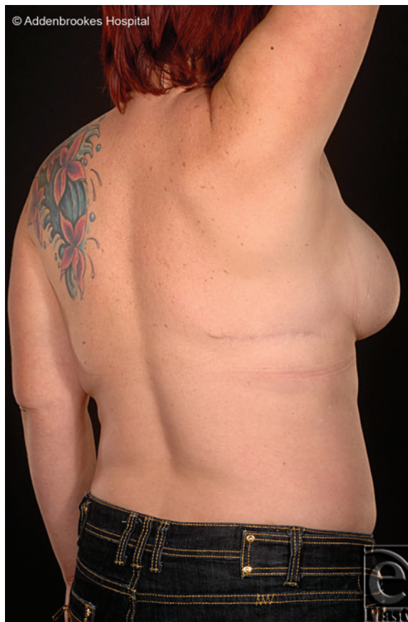
Figure 5. Well-healed latissimus dorsi flap donor site.