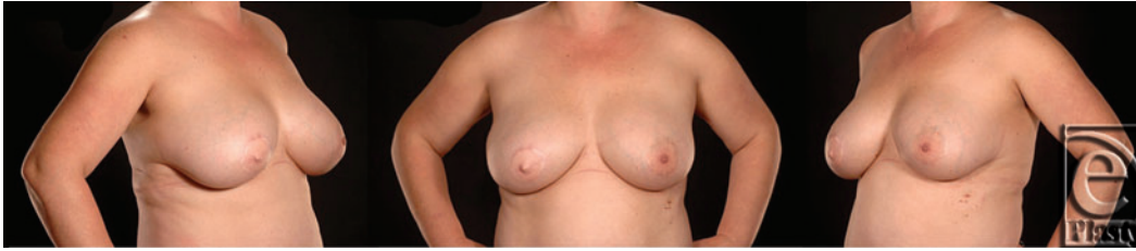
Figure 4. Final result 24 months following initial resection and latissimus dorsi flap reconstruction, following adjunctive bilateral breast augmentation, right nipple reconstruction, and nipple-areola complex tattooing. Note the final breast symmetry attained.